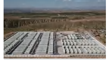
Ningxia, China 400 MWh