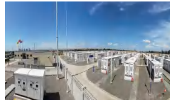
Ningxia, China 300 MWh