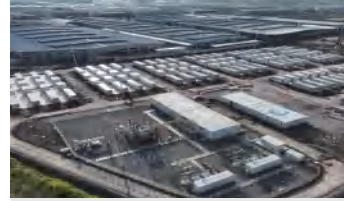
Chongqing, China 400 MWh