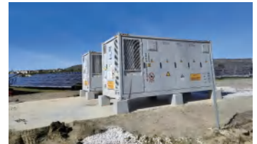
Trzhitsa, Bulgaria 7.45 MWh