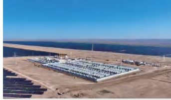
Xinjiang, China 800 MWh