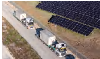
Sofia Bulgaria 7.45 MWh