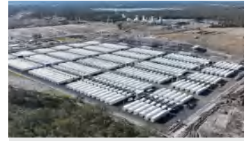
New South Wales, Australia 1,680 MWh