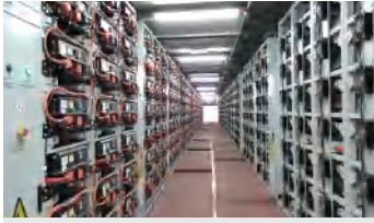
Morowali Industrial Park (IMIP), Indonesia 150 MWh