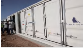
California, USA 117.5 MWh