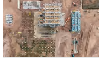
Texas, USA 130 MWh