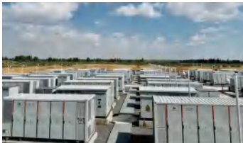
Ningxia, China 200 MWh