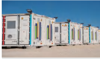
Texas, USA 226 MWh